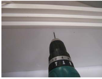
Drill the two indents