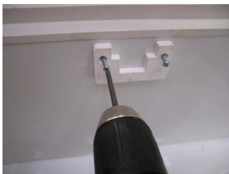
Secure the bracket with the screws supplied

With the four holes drilled secure the brackets with the cutouts facing up with the four screws provided. Locate the basket rail into the cutouts on the brackets. The baskets can be placed into position between the rail and breaker frame.