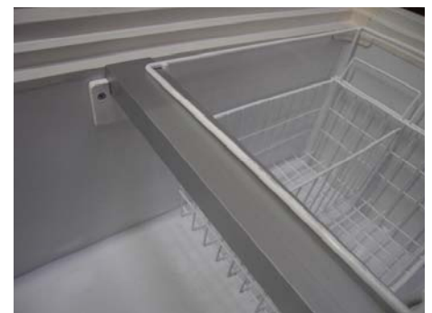
When both brackets are done the rail can be inserted and baskets placed

Please note that this must be undertaken only by a competent person and by following this guide you are doing so at your own risk. Total Refrigeration Ltd cannot be held responsible for any damage caused to the freezer. If you have any questions contact Total Refrigeration Ltd on 0845 127 2527