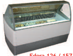
Edera 126 / 157