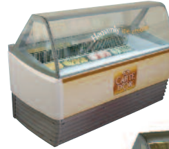
Carte D'Or Edera 10 / 13

By positioning and operating the cabinet correctly and then following a few steps to look after it, your Edera 126 / 157 / 10 / 13 scooping cabinet will run properly and efficiently.