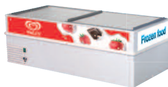
Wall's Take Home Island 150

By positioning and operating the cabinet correctly and then following a few steps to look after it, your VT150 / 200 / 250 island cabinet will run properly and efficiently.